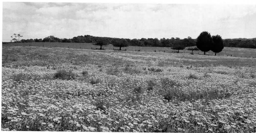
Beauty company Jurlique's biodynamic fields in South Australia's Adelaide Hills.